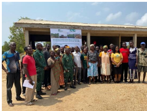
Group picture after community engagement