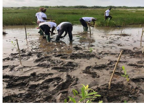
Community Mangrove planting Volunteer team. Planting exercise in progress