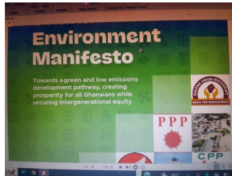
Screen shot of the CSO Env. Manifesto Doc