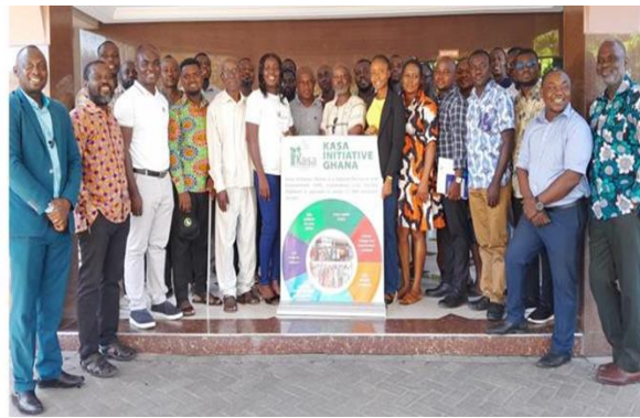
Pic 2 Group Picture of Participants at the PWYP forum