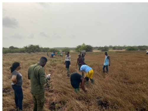
Mangrove Awareness/education event in community. Picture of field work, restoration action