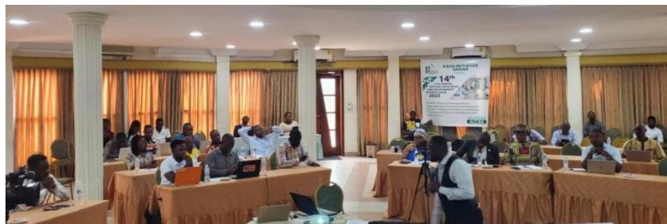
A section of the participants actively engaged during the forum