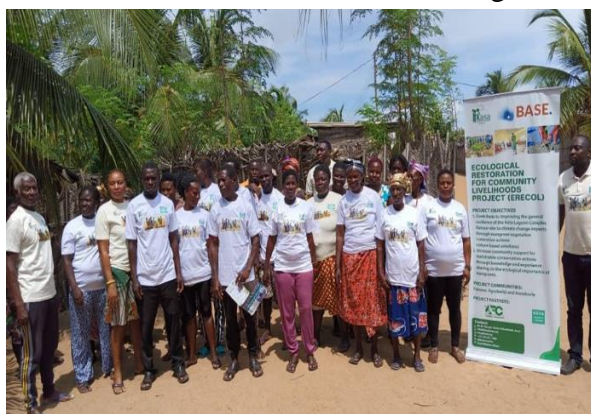
Pic 1- Community engagements on Mangrove restoration for climate resilience building actions