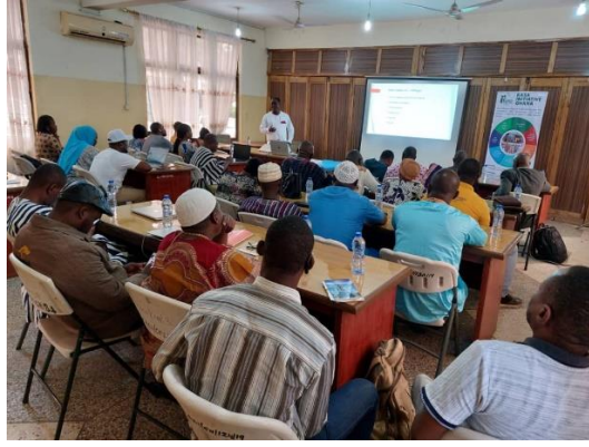
Group Picture and participants in session with the Manager of GSLERP project in Tamale