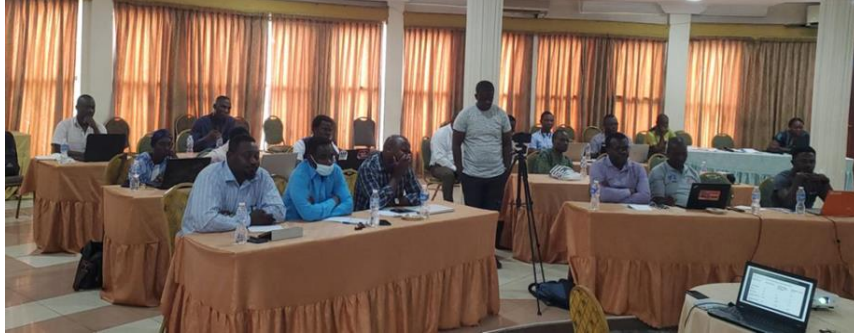
Pic 2-Group picture of participants at Event