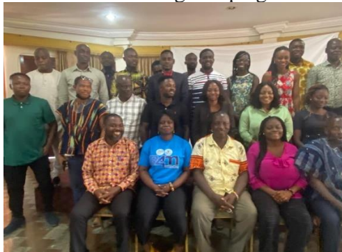
Group picture of CSO participants during forum.

In view of the above Kasa led a process to Document Environment and Sustainability Priorities from its CSOs perspective with several broad engagement through its platform and other platforms like Green Livelihood Alliance and CSOs SDG platforms. After these series of consultations in 2023 a final document summarising all the priorities is a 15-page document is developed and named Ghana Environment Manifesto. The next phase of this initiative in 2024 is to begin engaging all relevant stakeholders especially the politicians on these priorities for an informed and issue based electioneering campaigns.